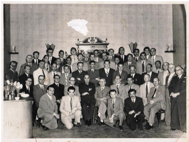
A group of Sanitary Inspectors with Dr. Paul Boffa Minister of Health and Social Services (1953)