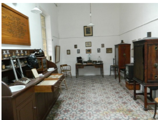
The laboratory where Dr. Temi Zammit carried out his research on Brucellosis in Palazzo Castellania, Valletta.

In August of 1907, the Sanitary Branch of the Public Health Department in Malta was divided into districts. Malta was divided into 3 main districts with a medical officer of health in charge of each district. Each district was subdivided into three sections, headed by a First Class Sanitary Inspector with a number of Second and Third Class Sanitary Inspectors under his charge.