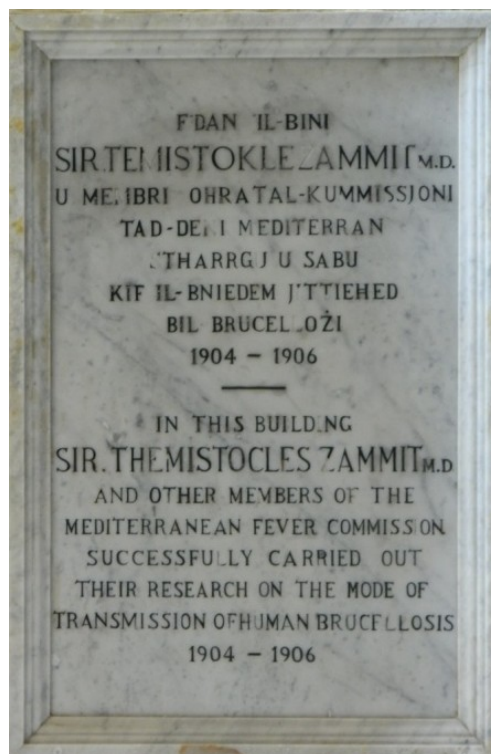
A memorial plaque found at the entrance of Palazzo Castellania, Valletta

In the same building which until 1998 housed the head office of the Public Health Department, Palazzo Castellania in Merchant Street, Valletta, Dr. Temi Zammit carried his research on the mode of transmission of Brucellosis. The room which served as a laboratory is still there, however not accessible to the general public.