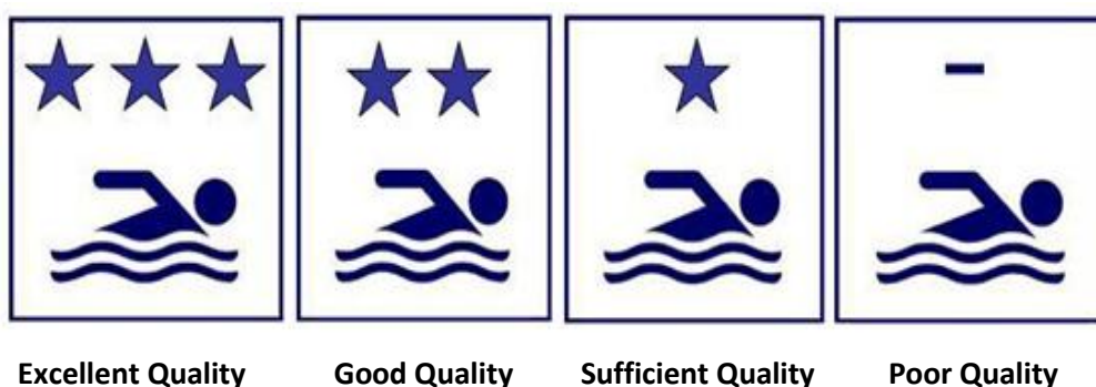
Figure 1: Bathing water star classification from left to right: 'excellent', 'good', 'sufficient' and 'poor'.

Bathing water quality is classified according to Directive 2006/7/EC as 'excellent', 'good', 'sufficient' or 'poor' using the symbols shown in Figure 1 below. Water quality data from the European Commission was last updated in 2013 ( Figure 2 ); the latest figures classify 98.9% of the Maltese Island's bathing waters as of excellent quality, with a very slight decline when compared to the previous year (European Environmental Agency, 2013).