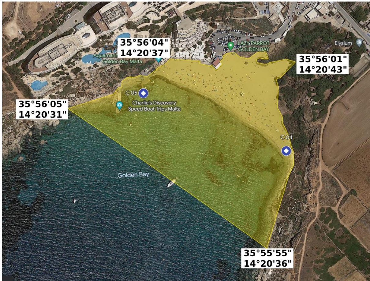
Figure 1: GIS for the Official Bathing Area of C04 & C05

MINISTRY for HEALTH and ACTIVE AGEING 15, PALAZZO CASTELLANIA, MERCHANTS STREET, VALLETTA, MALTA