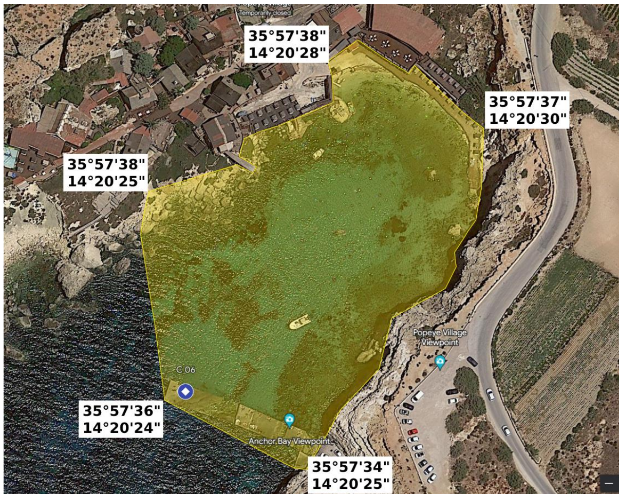
Figure 2: GIS for the Official Bathing Area of C06

1 NB this code is the site reference code used by the European Environment Agency.