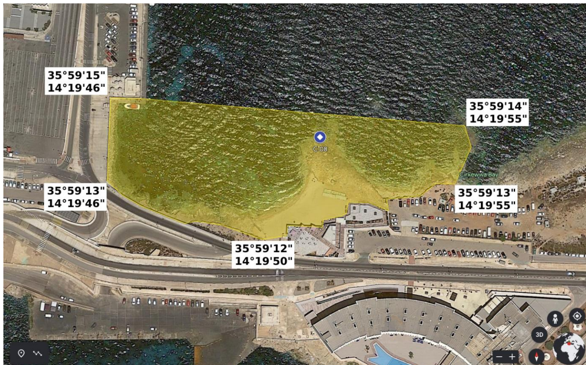
Figure 1: GIS for the Official Bathing Area of C08

MINISTRY for HEALTH and ACTIVE AGEING 15, PALAZZO CASTELLANIA, MERCHANTS STREET, VALLETTA, MALTA