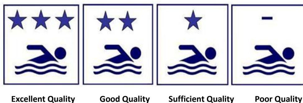
Figure 1: Star Classification

The bathing water quality is based on two microbiological parameters (Escherichia coli and Intestinal enterococci). These two parameters determine the classification of the bathing water quality as 'excellent', 'good', 'sufficient' or 'poor'. The symbols shown in Figure 1 below correspond to this classification. The European Environment Agency report for the year 2024 indicated that 92% of the bathing water classified as excellent quality, see Figure 4 . (European Environmental Agency, 2025).