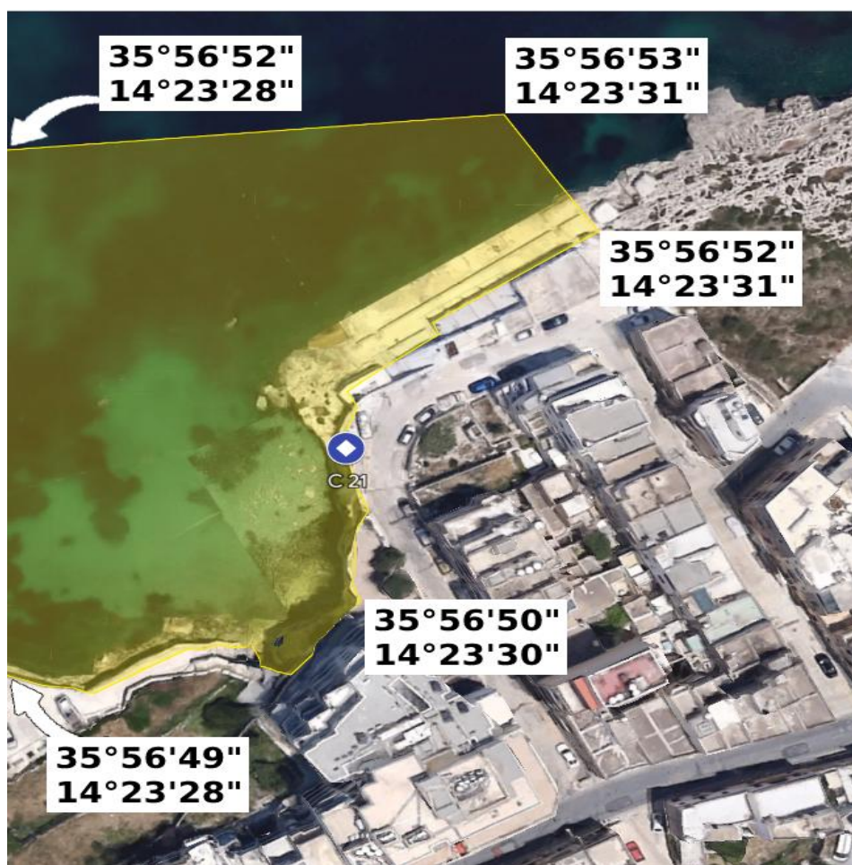
Figure 2: GIS for the Official Bathing Area of C21

1 NB this code is the site reference code used by the European Environment Agency.