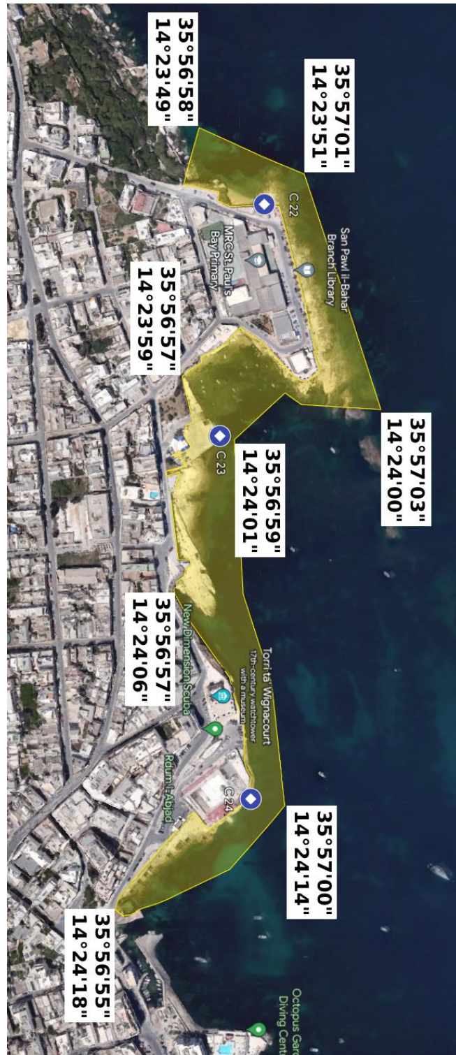
Figure 1: GIS for the Official Bathing Area of C22, C23 & C24

MINISTRY for HEALTH and ACTIVE AGEING 15, PALAZZO CASTELLANIA, MERCHANTS STREET, VALLETTA, MALTA