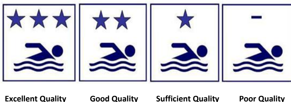
Figure 1: Star Classification

The bathing water quality is based on two microbiological parameters (Escherichia coli and Intestinal enterococci). These two parameters determine the classification of the bathing water quality as 'excellent', 'good', 'sufficient' or 'poor'. The symbols shown in Figure 1 below correspond to this classification. The European Environment Agency report for the year 2024 indicated that 92% of the bathing water classified as excellent quality, see Figure 3 . (European Environmental Agency, 2025).