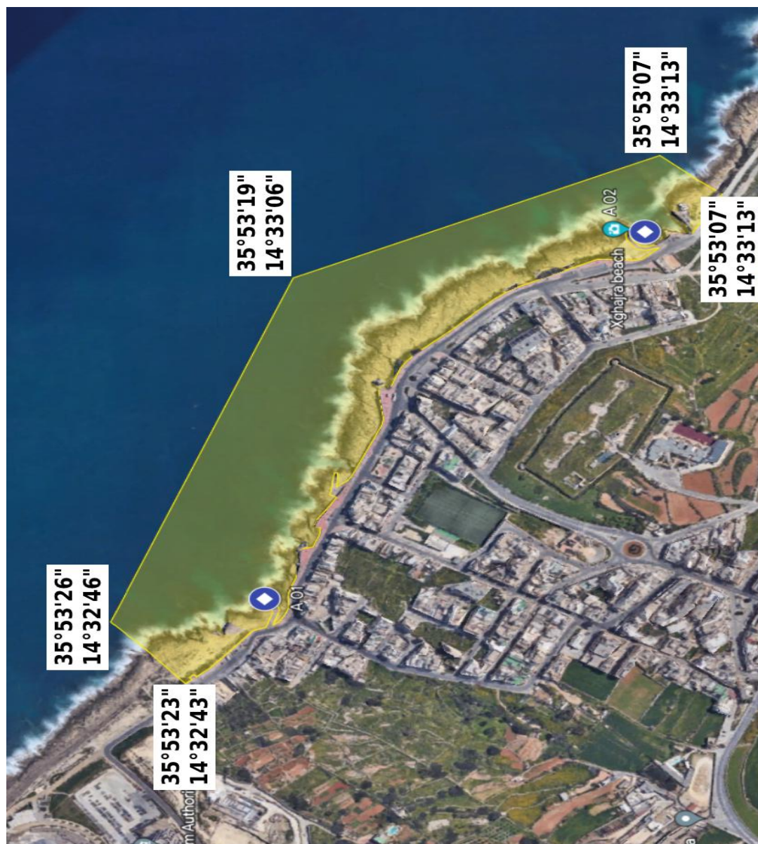
Figure 2: GIS for the Official Bathing Area of A01 & A02

1 NB this code is the site reference code used by the European Environment Agency.