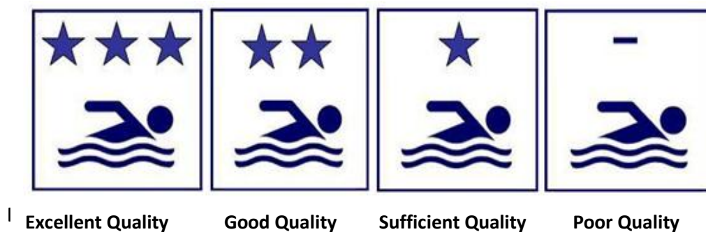
Figure 1: Star Classification

The bathing water quality is based on two microbiological parameters (Escherichia coli and Intestinal enterococci). These two parameters determine the classification of the bathing water quality as 'excellent', 'good', 'sufficient' or 'poor'. The symbols shown in Figure 1 below correspond to this classification. The European Environment Agency report for the year 2024 indicated that 92% of the bathing water classified as excellent quality, see Figure 3 . (European Environmental Agency, 2025).