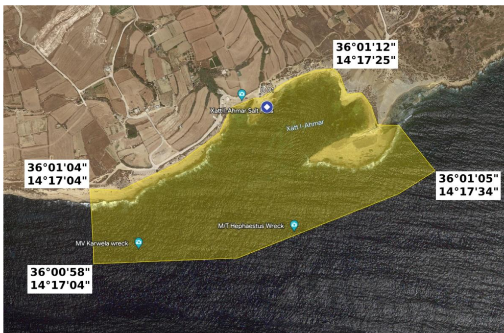
Figure 2: GIS for the Official Bathing Area of D01

1 NB this code is the site reference code used by the European Environment Agency.