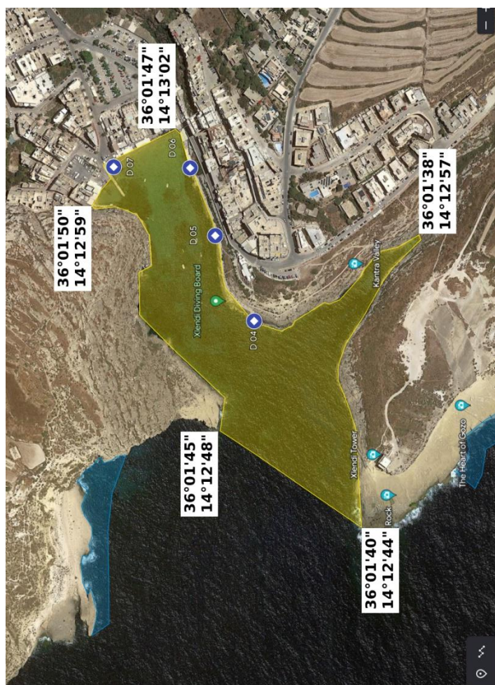
Figure 2: GIS for the Official Bathing Area of D04, D05, D06 & D07

1 NB this code is the site reference code used by the European Environment Agency.