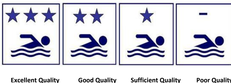
Figure 1: Star Classification

The bathing water quality is based on two microbiological parameters (Escherichia coli and Intestinal enterococci). These two parameters determine the classification of the bathing water quality as 'excellent', 'good', 'sufficient' or 'poor'. The symbols shown in Figure 1 below correspond to this classification. The European Environment Agency report for the year 2024 indicated that 92% of the bathing water classified as excellent quality, see Figure 3 . (European Environmental Agency, 2025).