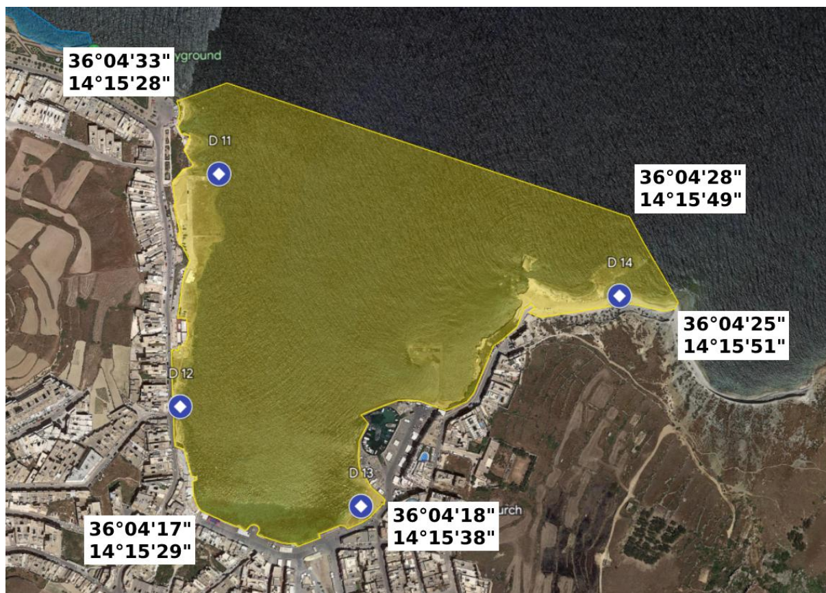
Figure 2: GIS for the Official Bathing Area of D11, D12, D13 & D14

1 NB this code is the site reference code used by the European Environment Agency.