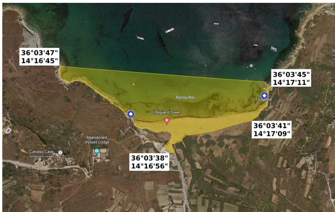
Figure 2: GIS for the Official Bathing Area of D15 & D16

1 NB this code is the site reference code used by the European Environment Agency.