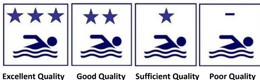
Figure 1: Star Classification

The bathing water quality is based on two microbiological parameters (Escherichia coli and Intestinal enterococci). These two parameters determine the classification of the bathing water quality as 'excellent', 'good', 'sufficient' or 'poor'. The symbols shown in Figure 1 below correspond to this classification. The European Environment Agency report for the year 2024 indicated that 92% of the bathing water classified as excellent quality, see Figure 5 . (European Environmental Agency, 2025).