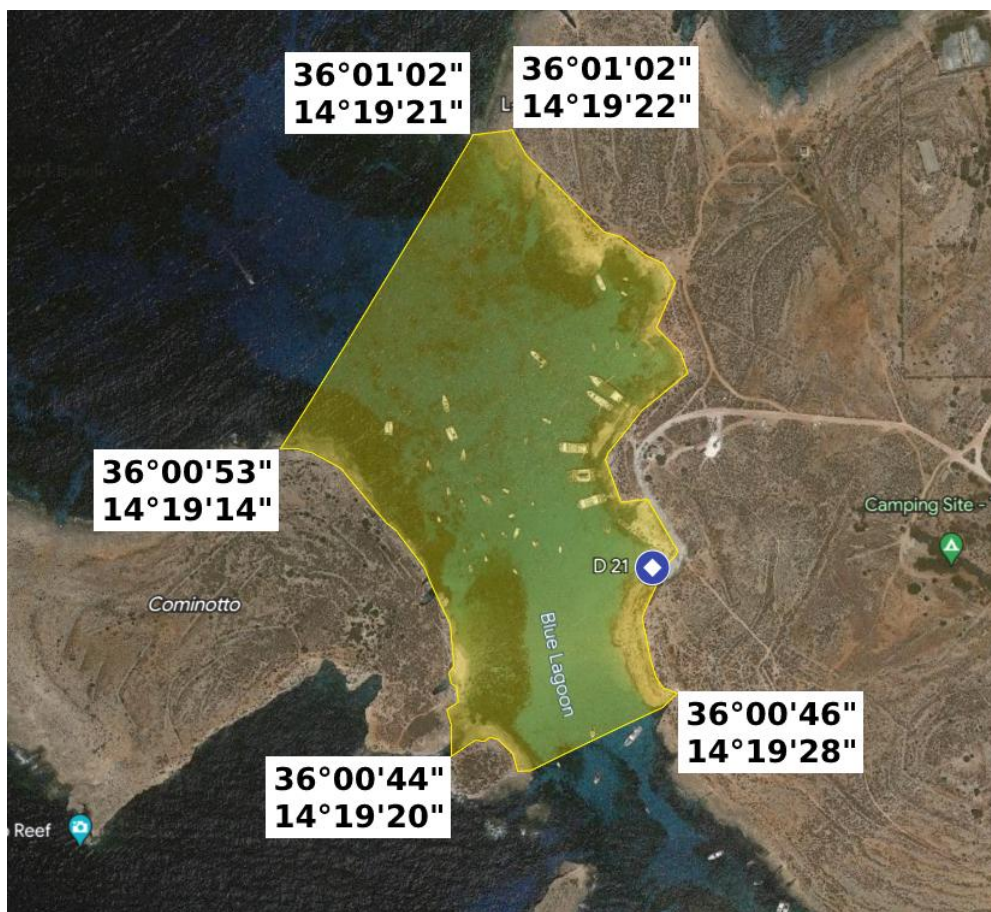
Figure 2: GIS for the Official Bathing Area of D21

1 NB this code is the site reference code used by the European Environment Agency.