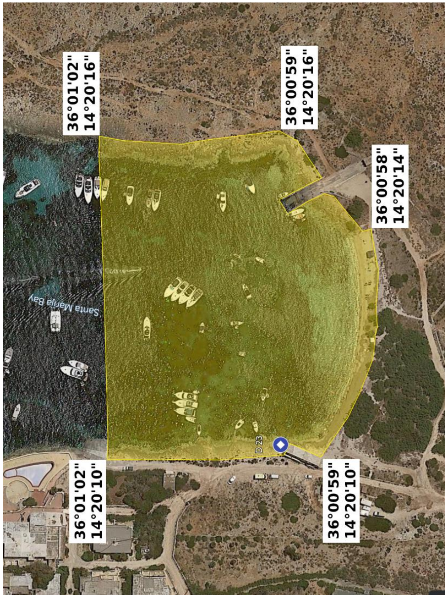
Figure 1: GIS for the Official Bathing Area of D23

MINISTRY for HEALTH and ACTIVE AGEING 15, PALAZZO CASTELLANIA, MERCHANTS STREET, VALLETTA, MALTA