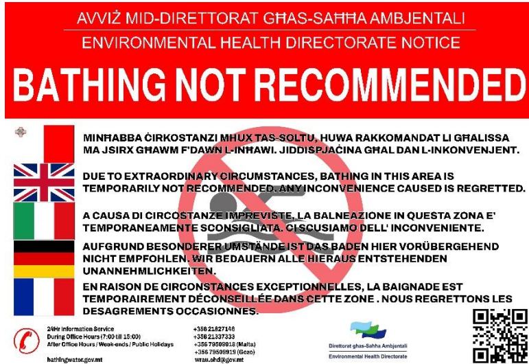
Figure 6: Signs placed on site for temporary closing of A12.

MINISTRY for HEALTH and ACTIVE AGEING 15, PALAZZO CASTELLANIA, MERCHANTS STREET, VALLETTA, MALTA