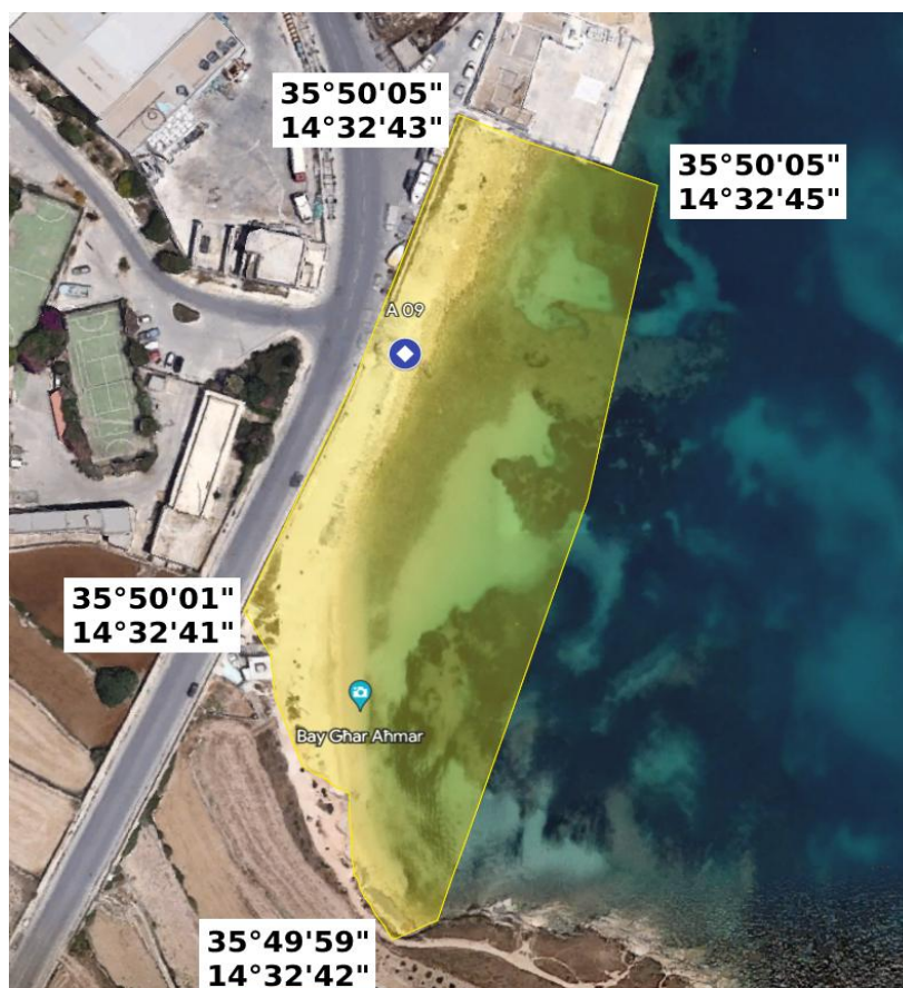
Figure 2: GIS for the Official Bathing Area of A09

1 NB this code is the site reference code used by the European Environment Agency.