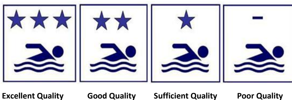
Figure 1: Star Classification

The bathing water quality is based on two microbiological parameters (Escherichia coli and Intestinal enterococci). These two parameters determine the classification of the bathing water quality as 'excellent', 'good', 'sufficient' or 'poor'. The symbols shown in Figure 1 below correspond to this classification. The European Environment Agency report for the year 2024 indicated that 92% of the bathing water classified as excellent quality, see Figure 3 . (European Environmental Agency, 2025).