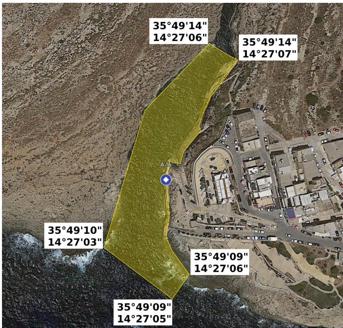
Figure 2: GIS for the Official Bathing Area of A12

1 NB this code is the site reference code used by the European Environment Agency.