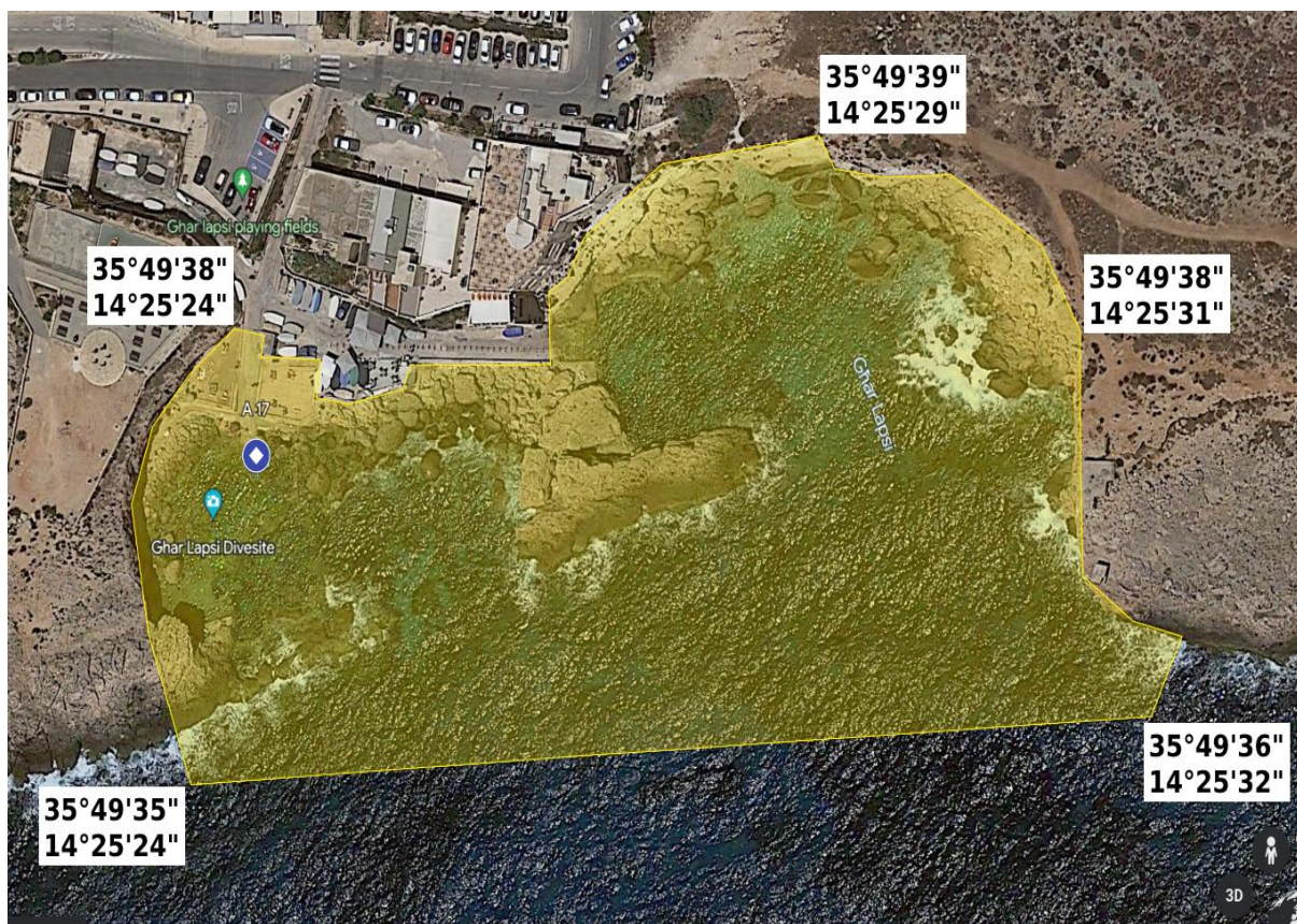
Figure 2: GIS for the Official Bathing Area of A17

1 NB this code is the site reference code used by the European Environment Agency.