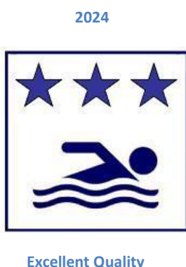
Table 3: Bathing water quality classification at (2021 - 2024)

MINISTRY for HEALTH and ACTIVE AGEING 15, PALAZZO CASTELLANIA, MERCHANTS STREET, VALLETTA, MALTA