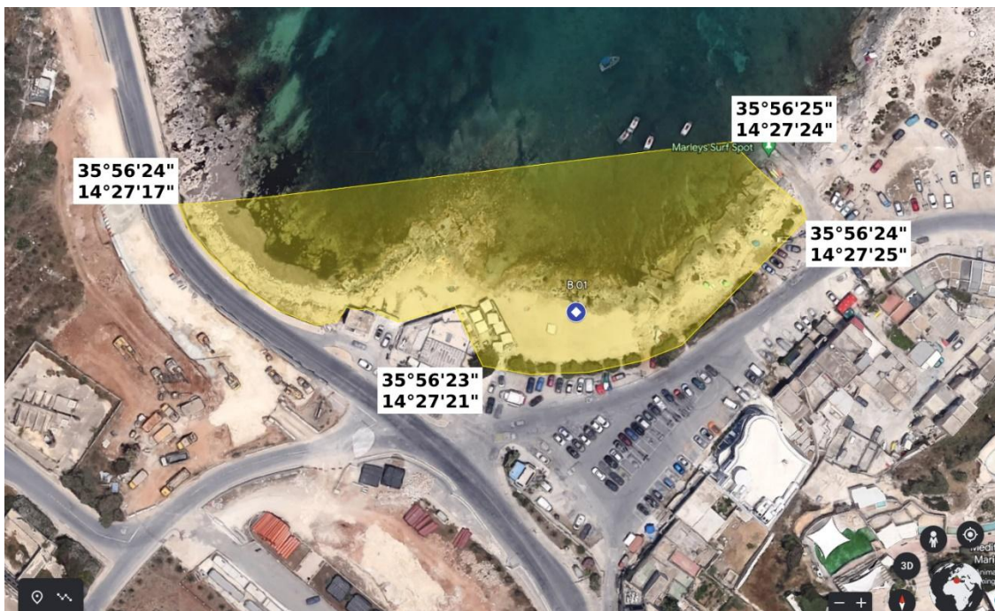
Figure 2: GIS for the Official Bathing Area of B01

1 NB this code is the site reference code used by the European Environment Agency.