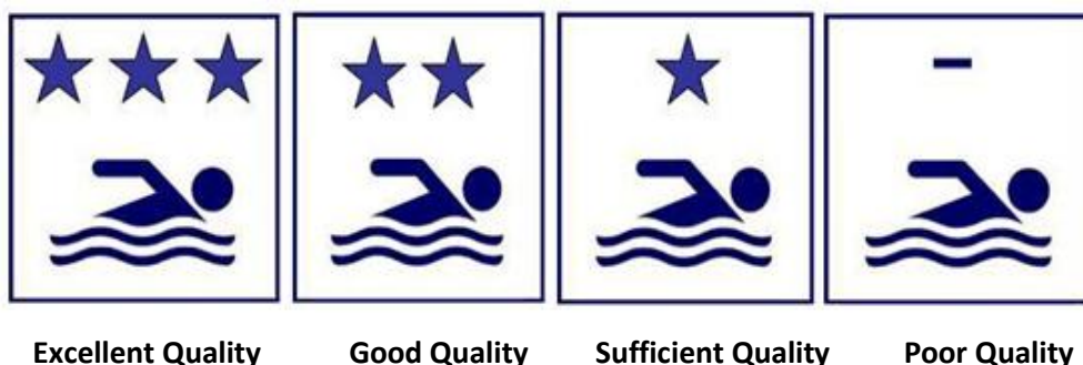
Figure 1: Star Classification

The bathing water quality is based on two microbiological parameters (Escherichia coli and Intestinal enterococci). These two parameters determine the classification of the bathing water quality as 'excellent', 'good', 'sufficient' or 'poor'. The symbols shown in Figure 1 below correspond to this classification. The European Environment Agency report for the year 2024 indicated that 92% of the bathing water classified as excellent quality, see Figure 3 . (European Environmental Agency, 2025).