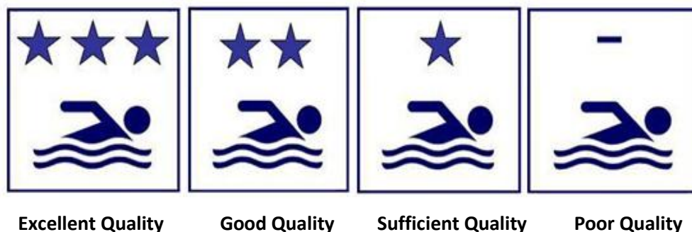
Figure 1: Star Classification

The bathing water quality is based on two microbiological parameters (Escherichia coli and Intestinal enterococci). These two parameters determine the classification of the bathing water quality as 'excellent', 'good', 'sufficient' or 'poor'. The symbols shown in Figure 1 below correspond to this classification. The European Environment Agency report for the year 2024 indicated that 92% of the bathing water classified as excellent quality, see Figure 3 . (European Environmental Agency, 2025).