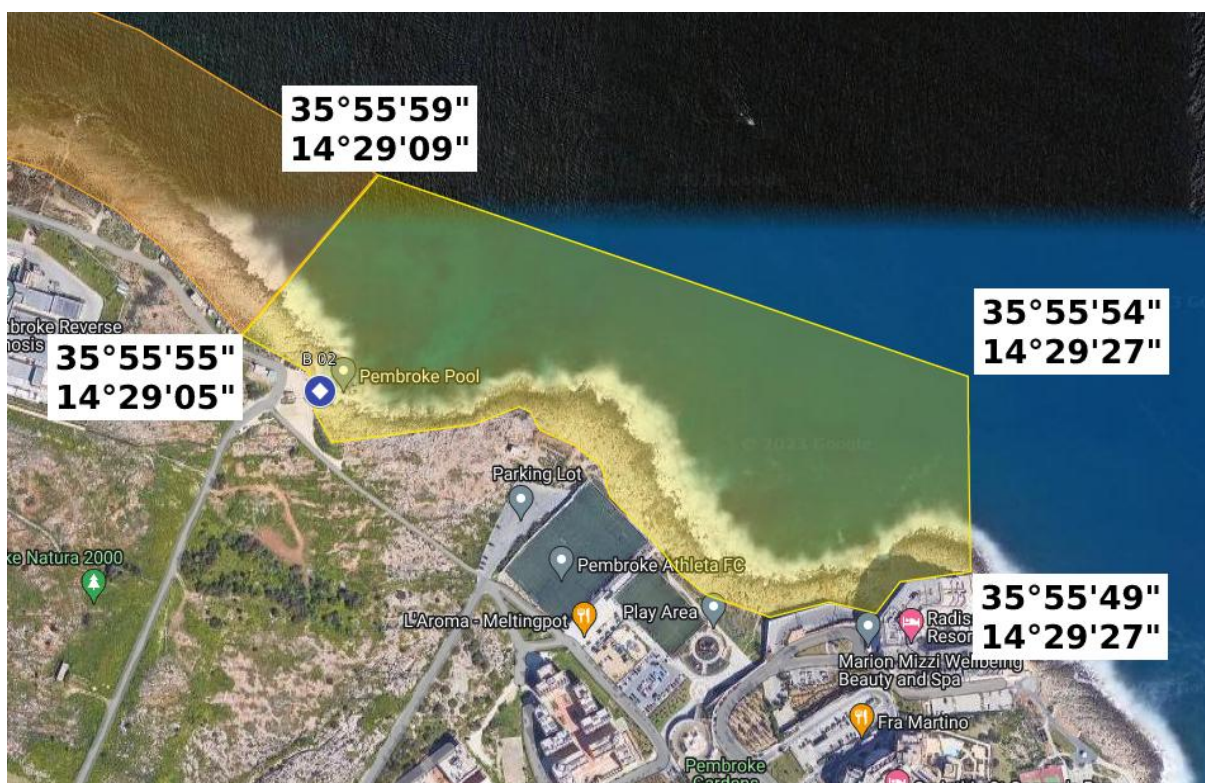
Figure 2: GIS for the Official Bathing Area of B02

1 NB this code is the site reference code used by the European Environment Agency.