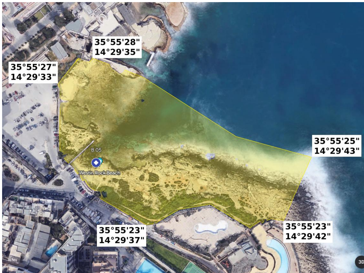
Figure 3: GIS for the Official Bathing Area of B05

MINISTRY for HEALTH and ACTIVE AGEING 15, PALAZZO CASTELLANIA, MERCHANTS STREET, VALLETTA, MALTA