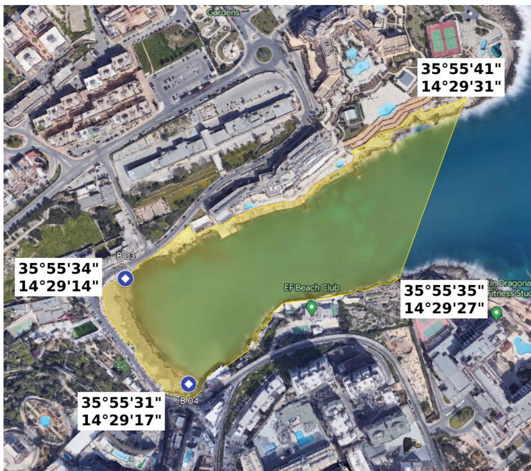
Figure 2: GIS for the Official Bathing Area of B03 & B04

1 NB this code is the site reference code used by the European Environment Agency.