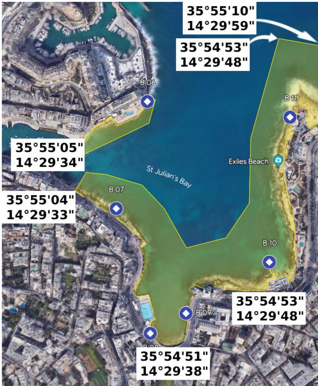
Figure 3: GIS for the Official Bathing Area of B07, B08, B09, B10 & B11

MINISTRY for HEALTH and ACTIVE AGEING 15, PALAZZO CASTELLANIA, MERCHANTS STREET, VALLETTA, MALTA