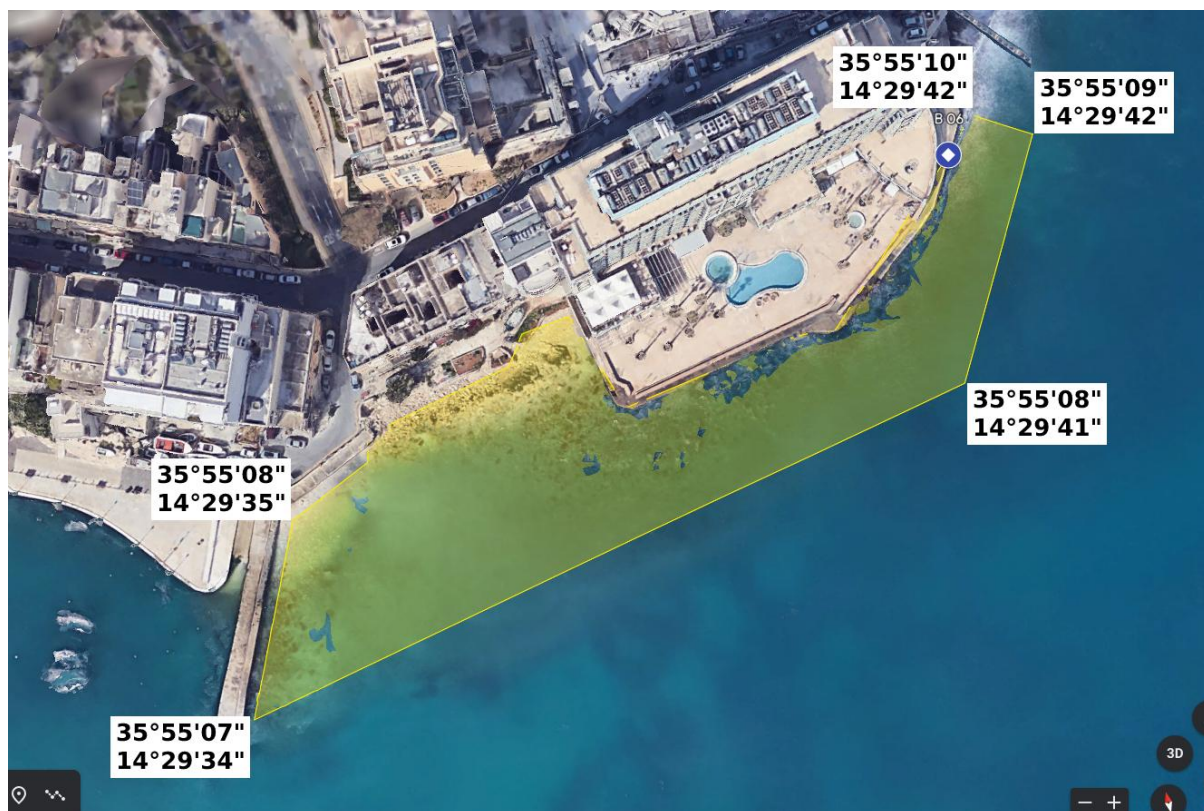
Figure 2: GIS for the Official Bathing Area of B06

1 NB this code is the site reference code used by the European Environment Agency.